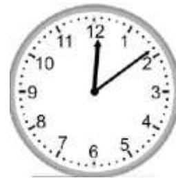
9 minutes past 12